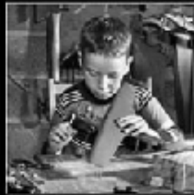
What my mom thinks I do