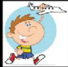
What my wife thinks I do