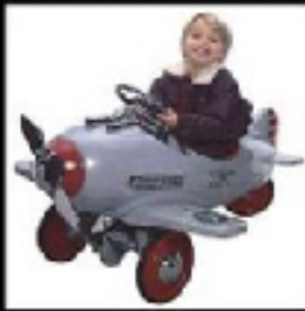
What my friends think I do