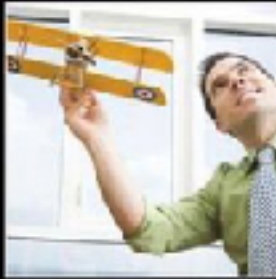
What my co-workers think I do