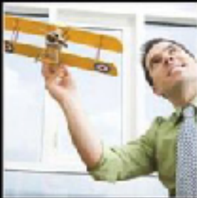
What my co-workers think I do